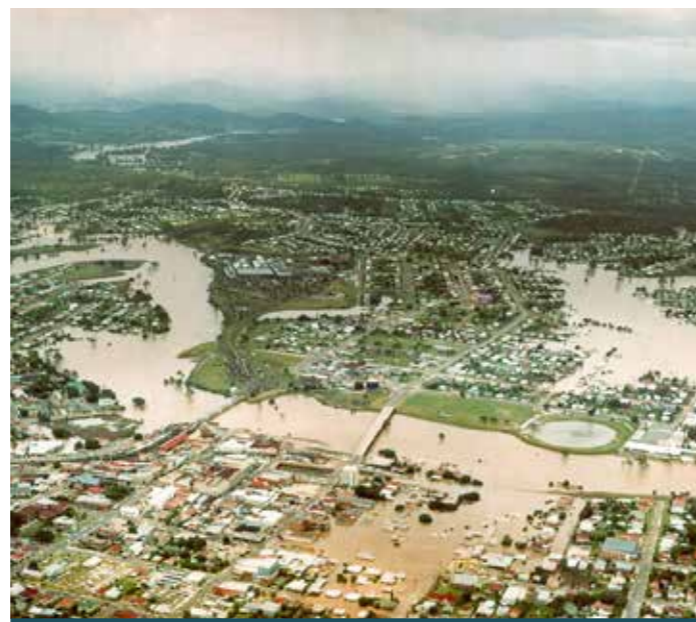
North Ipswich – 1974 flood

Following the 1974 flood, the Wivenhoe Dam was built with construction completed in 1985.