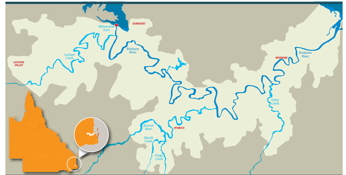
The Flood Study focusses on flooding downstream of Wivenhoe Dam including the Brisbane River and major waterways such as Lockyer Creek and the Bremer River system.

The largest recorded flood event occurred in 1841, however oral history shared by the local Jagera and Turrbal clans indicate that a flood, much larger than that of 1841, occurred up to a century before.