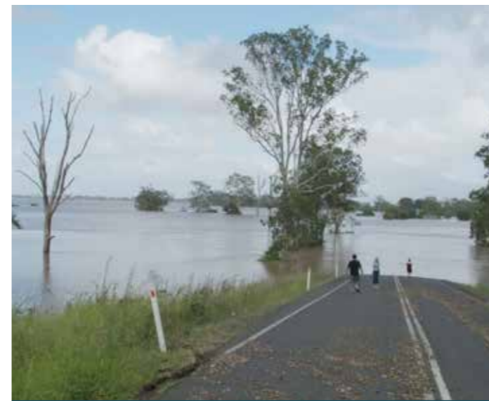
Somerset, Lowood – 2011 flood

The Queensland Floods Commission of Inquiry was subsequently established and recommended a number of changes to how state and local governments manage flooding, including the development of a catchment flood study for the Brisbane River.