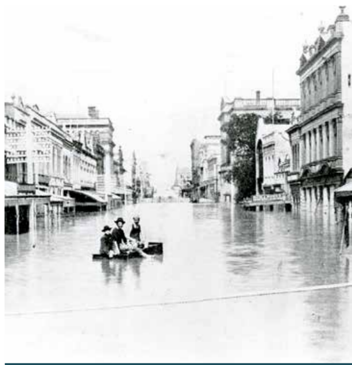
Brisbane City, Queen Street – 1893 flood

It was after the 1893 flood that discussions first began about the creation of Somerset Dam. Construction of the dam commenced in 1935 and was completed in 1959.