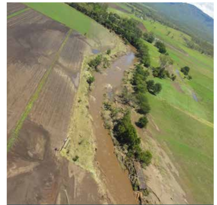
Lockyer Valley, Thornton School Bridge – 2013 flood

In 2016, a Catchment Action Plan was developed specifically for the Lockyer Valley region called the Lockyer Catchment Action Plan 2015-2018.