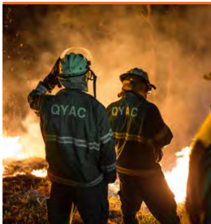
This project is a partnership between the Queensland Government and the Quandamooka Yoolooburrabee Aboriginal Corporation.

The Quandamooka Aboriginal Land and Sea Management Agency (QALSMA) is the unit within QYAC responsible for the planning, management and protection of the Quandamooka Estate. QALSMA works in collaboration with local, state and federal agencies to implement a range of natural and cultural resource management programs including fire management.