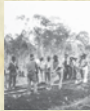
The railway line is built through Sandy Creek (the original name for the siding at Grantham).