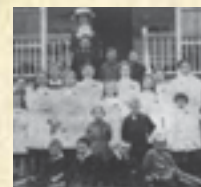
Grantham State School celebrates its centenary.