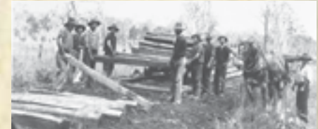
New cattle and pig yards are built at the railway station.