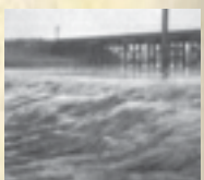
More flooding causes substantial damage to businesses and houses.