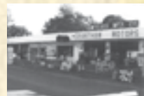
Dwyers Manufacturing Company opens on the highway. The company also operates Grantham Motors.