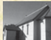
Residents meet at the School of Arts on April 30 to establish St Gabriel's Anglican Church.