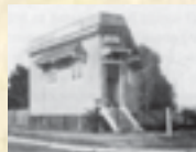
National Bank of Australasia moves into a new timber triangular building known locally as the 'Wedge of Cheese'.