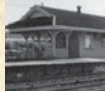
Electricity is installed at the railway station.