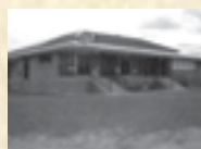
The Grantham Hotel moves in April from William Street, after 50 years, to a new site on the Warrego Highway.